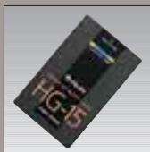
Fujix Image Memory Cards HG-5, HG-10, HG-15 and HG-40