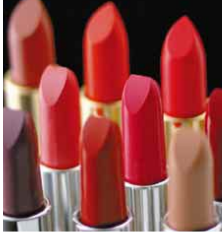
1,280 X 1,000 pixels, shutter speed 1/350, F4.8 Hi Mode

Unmatched tonality, minimal moiré, less noise . . . the colors you see will be the colors you get with the DS-560 and DS-565. They're