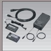
Fujix Power Supply Kit PK-D56 • Fujix AC Power Adapter AC-D56 • Fujix Rechargeable Battery Pack BP-D56