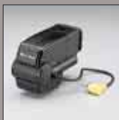
Fujix LCD Viewfinder LV-D3