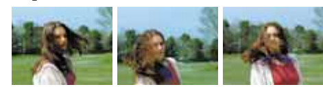
Use the DS-565 to capture all the action with Continuous Mode shooting as fast as 3 frames per second.

The DS-560 records fast-moving subjects at a fast 1 frame per second*, while the DS-565 has a Continuous Mode for shooting up to 12 frames at a high-speed 3 frames per second. It's everything you need and want for action photography. And you won't worry about having enough power for rapid-fire shooting since the latest battery technologies deliver as many as 1,000 frames from a single charge. With its new Nickel Metal Hydride construction, the rechargeable battery is also easier on the environment.